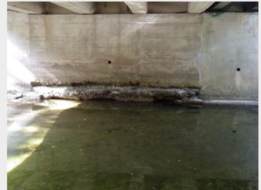
Location of Abutment Undermining