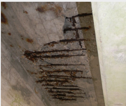
Spalling and Exposed Rebar

The bridge will be constructed with ABC methods, which will expedite construction and reduce disturbance to the public. There will be an allowable 10 day road closure with temporary single lane closures two weeks prior to and following the bridge closure period.